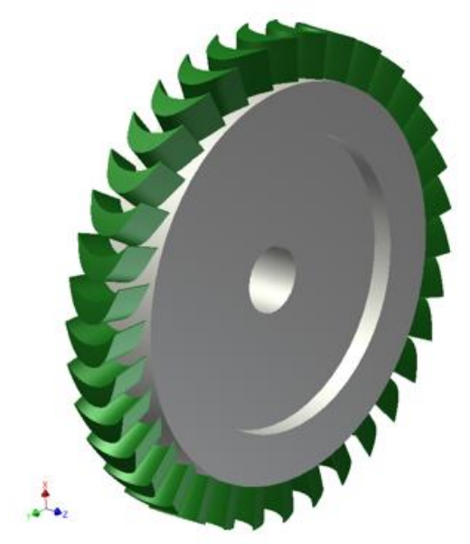
Fig. 1. Three-dimensional geometry of the microturbine rotor disc

The diameter of the disc was Ø36 mm and the height of the blade was equal to 3 mm. The nominal rotational speed of the turbogenerator rotor was 100,000 rpm. On one side of the disc, a neck was made, and a port was located in the axis of the disc (Fig. 1).